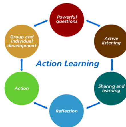
Figure 1. WIAL solution spheres for action learning

So based on the aims of critical thinking dispositional features (CCTST) and action learning approaches the researcher collected the research data, which elaborated in the pre-test phase of the data collection for the research question number one, the researcher had to employ two research tools; the California Critical Thinking Skills Test (CCTST) and Marquardt model's component of action learning approaches. The idea behind this action learning model was that a learner could comprehend knowledge by working with other classmates or team members in a social setting to find a solution to a problem.